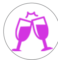
Events & Occasions