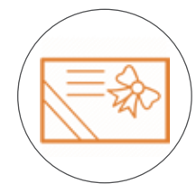
Every Day Cards